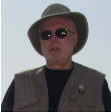
Our Fearless Editor Abroad & on Assignment